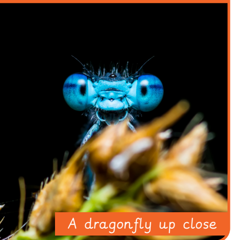
A dragonfly up close

An example of a photo taken with a macro lens.